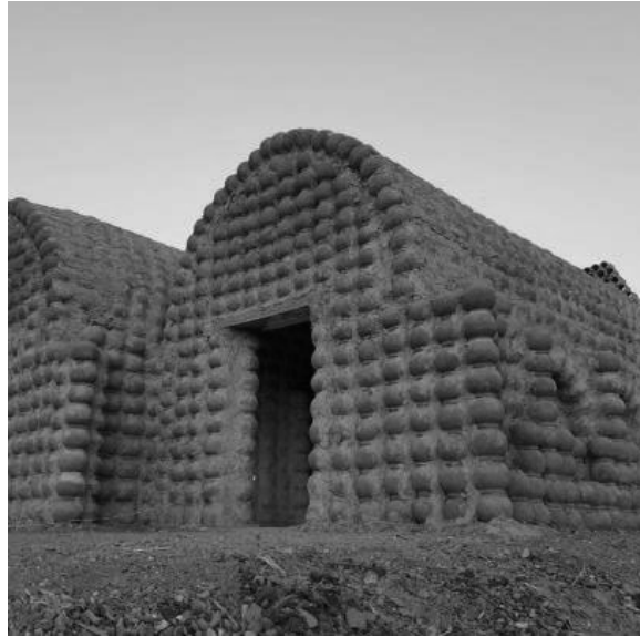
Figure 3. "Using pottery in build the visitor center | Author"

The idea relied on building with the traditional methods used by the people of the region in the past, while developing it with advanced science. We built using pots from pottery, and using the concept of vaults & domes method. In addition to the participation of the local community in all stages of the work, with the aim of working to produce architecture "cultural product" that deserves to be a heritage in the future.