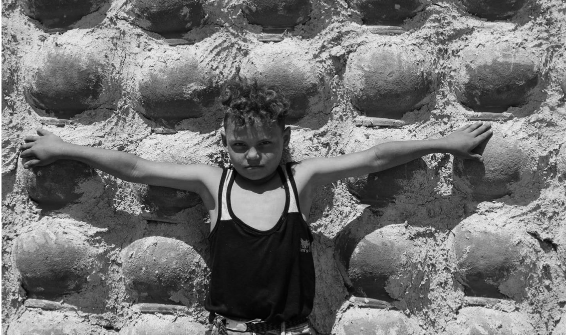
Figure 5. "It is my cultural product & it will be a heritage in the future"