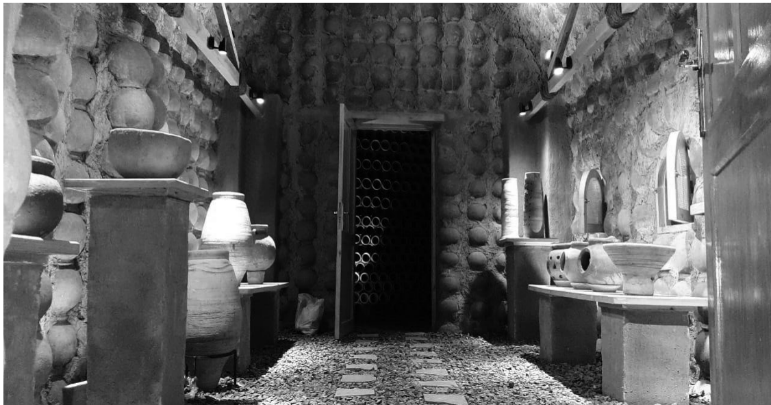
Figure 4. "Interior of visitor center | Author"